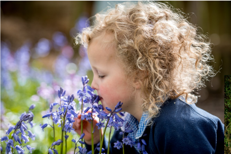
At little 'sneak-peak' from our school photo shoot on Tuesday.....